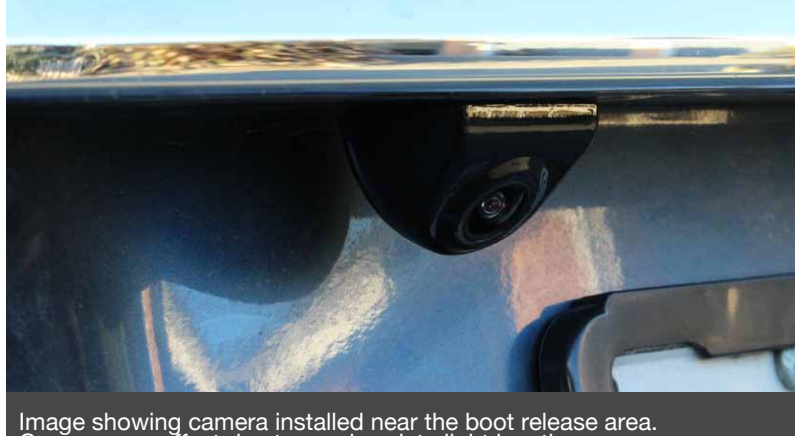
Image showing camera installed near the boot release area. Camera was offset due to numberplate light location.