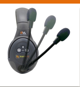
Boom swivels over the top 270º Mic can be worn on left or right.