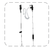
Earpiece with Transparent Acoustic Tube