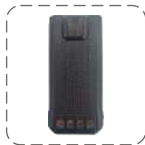
Li-ion Battery 2200mAh