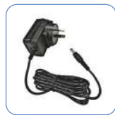
Power Adapter 12V/1A