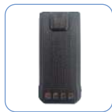
Li-ion Battery 1500mAh